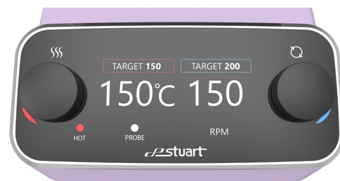
Hotplate stirrer premium interface

With TFT display for temperature and stirring