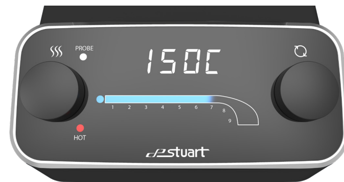
Hotplate stirrer digital interface

With constant digital temperature display