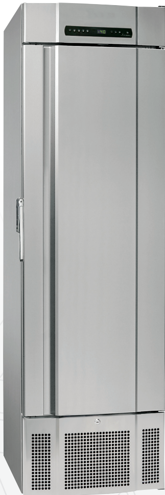
BioMidi EF425. Drawers are optional extras.