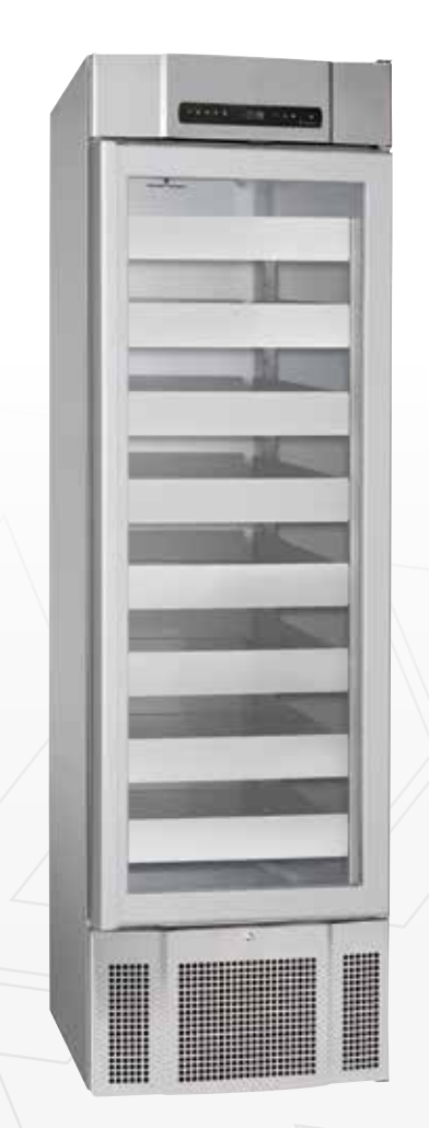
BioMidi 425. Drawers and glass door are optional extras.